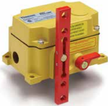
SPS-2E & SPS-4E