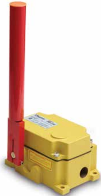
ROS-2E & ROS-4E

The switch can be ordered with an option where one of the SPDT switches is actuated with clockwise rotation and the other SPDT switch is actuated with counter-clockwise rotation. This allows you to identify which direction the switch is activated from.