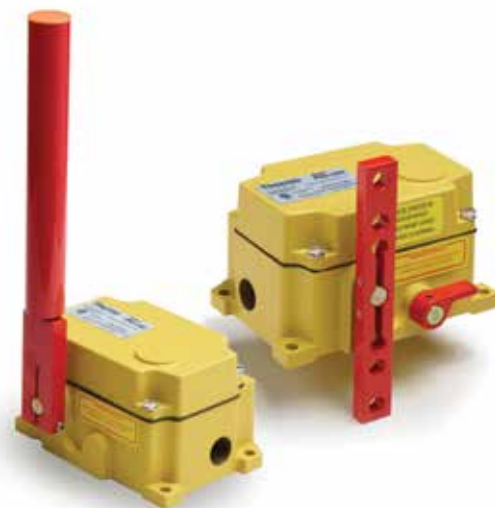
Improved ROS & SPS Versions

These conveyor protection switches utilize a rugged heavy duty design. They are built to last, providing many years of dependable service. The modular design of the base unit provides added convenience for installation and maintenance. Numerous options allow you to pick the right switch to fit your applications. Use the conveyor protection switches to protect your business in even the most challenging applications.